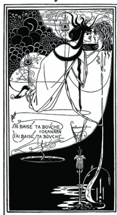
DESIGN FOR "SALOME" From "The Studio"

Download Full Pages Read Online Cover Design for the 'Yellow Book' Aubrey Beardsley Tate Aubrey Beardsley Cover Design for the 'Yellow Book'